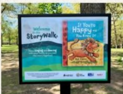
StoryWalk in an Eau Claire, WI City Park (L.E. Phillips Memorial Public Library)

This collaborative project is made possible through a grant awarded to the Lester Public Library Foundation by the West Foundation.