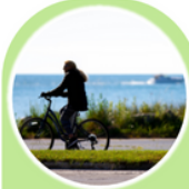
Vibrant quality of life.