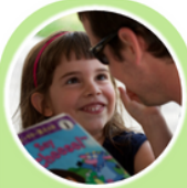
Healthy human population.