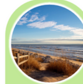
Clean air and water.