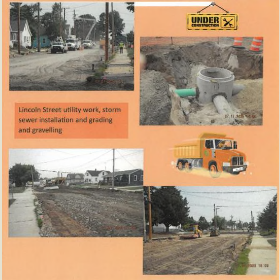
Lincoln Street utility work, storm sewer installation and grading and gravelling

Anticipate completion by Labor Day, with possible exception of terrace areas.