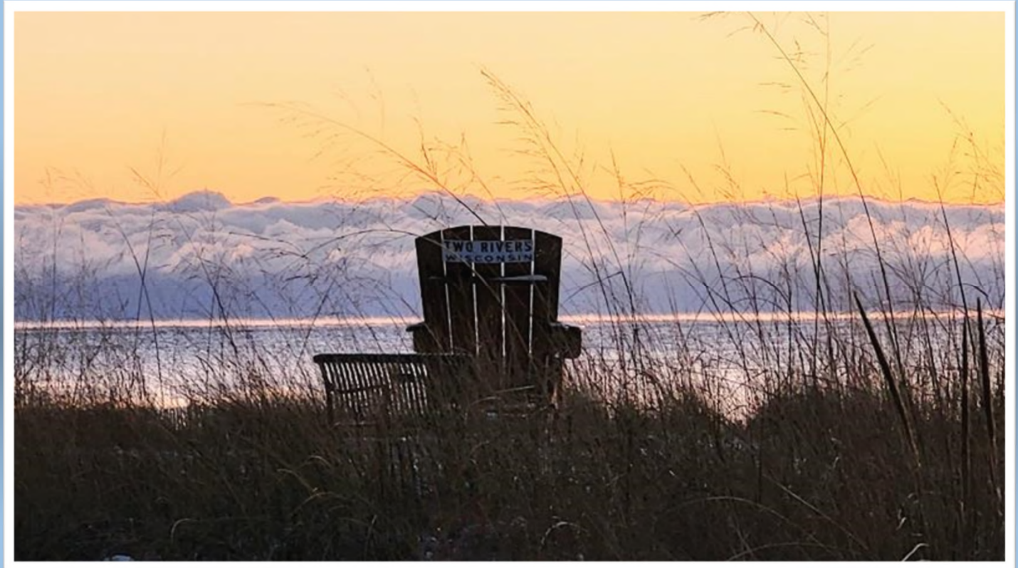
Lake Michigan Making Clouds—11 degrees at 6:30 AM , November 28, 2023 at Neshotah Beach