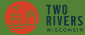
City of Two Rivers Room Tax Revenues by Report Month