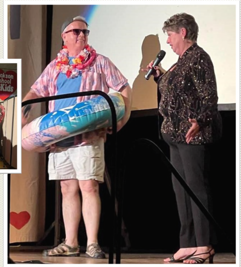
City Manager, appearing as a "Floating Holiday," assisted with last Saturday's toilet seat auction