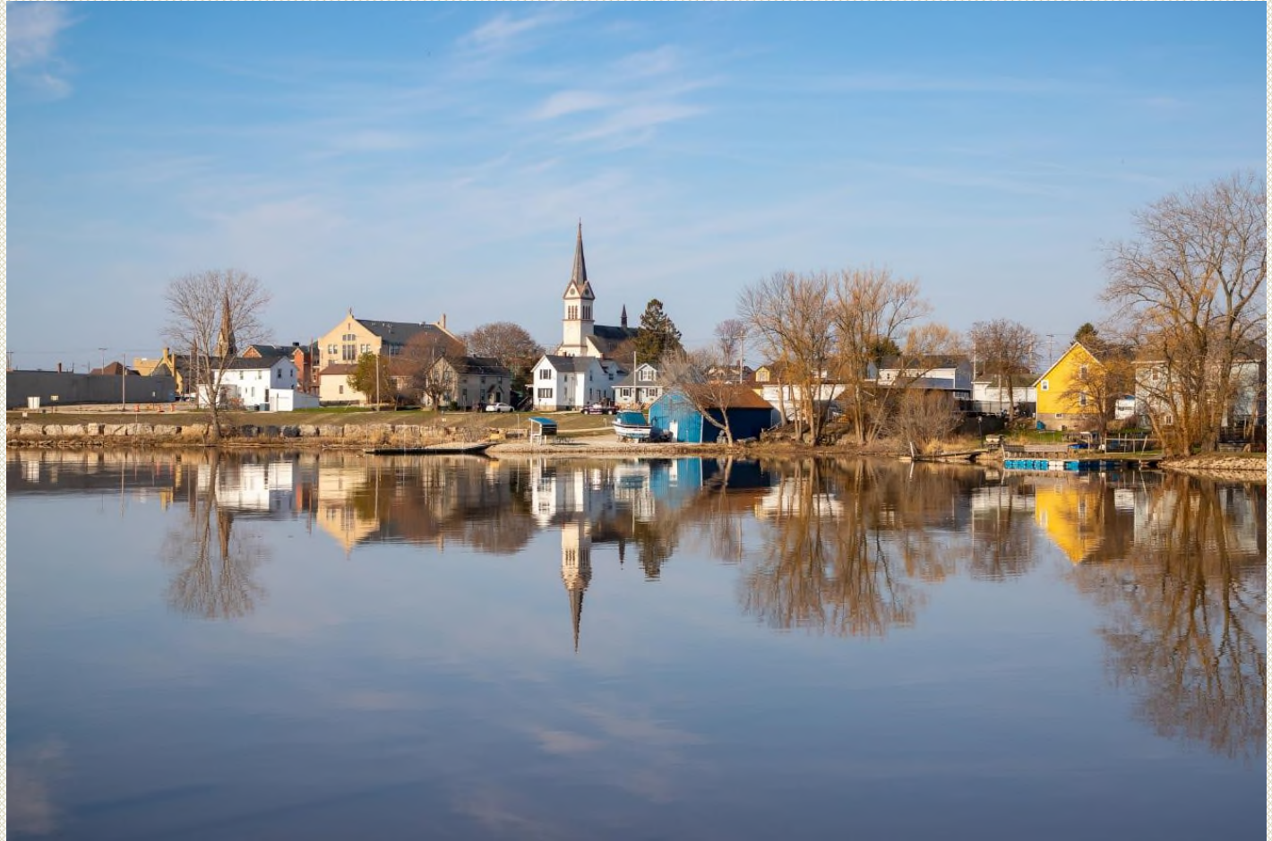
Friday morning, April 28, along the East Twin River