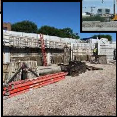
Other Projects by the Developer Left: Brin Project, Menasha Right: Banta Village, Menasha