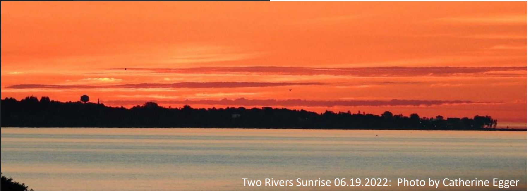
Two Rivers Sunrise 06.19.2022