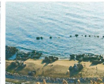
Figure 19b: Implementation of the Concordia University natural shoreline