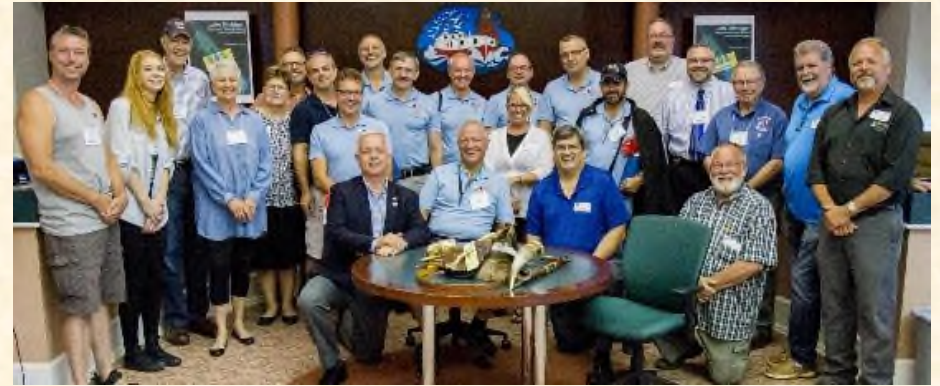
2018 Sister City Visit

Exciting plans are in process for hosting our Domazlice Friends! Ten student musicians and eight adults will be in Two Rivers for our second exchange. Two Rivers Public District and the City of Two Rivers planning a week of events: The Domazlice students will join our high school band and vocalists in our Memorial Day Parade and Ceremonies; Czech Music in the Central Park on Wednesday, June 1