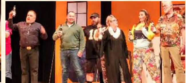
City Council Meeting May 2, 2022