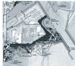
Figure 19a: Design of a more naturalized shoreline and beach area.

In addition to the surge mitigation solutions and potential scenarios for marina development, the City wishes to maximize their legal domain granted them along the Lake Michigan shoreline located between the Lighthouse Inn and the existing harbor entrance south jetty. An agreement between the City of Two Rivers and the Wisconsin DNR gives the City the right to place fill on the lakebed to a defined bulkhead line provided the use of the fill is for public recreational and/or marina related purposes. A suggested solution to stabilize that reach of shoreline and enhance both ecological value and recreational user benefit is shown in Figure 19. This solution is similar to the shoreline restoration work recently completed for Concordia University in Mequon, Wisconsin (Figure 19), integrating a naturalized shoreline and beach with robust erosion resistance. Secondly it can be designed to retain drifting sand that may otherwise be lost off-shore and eventually deposited into the harbor entrance (requiring maintenance dredging).